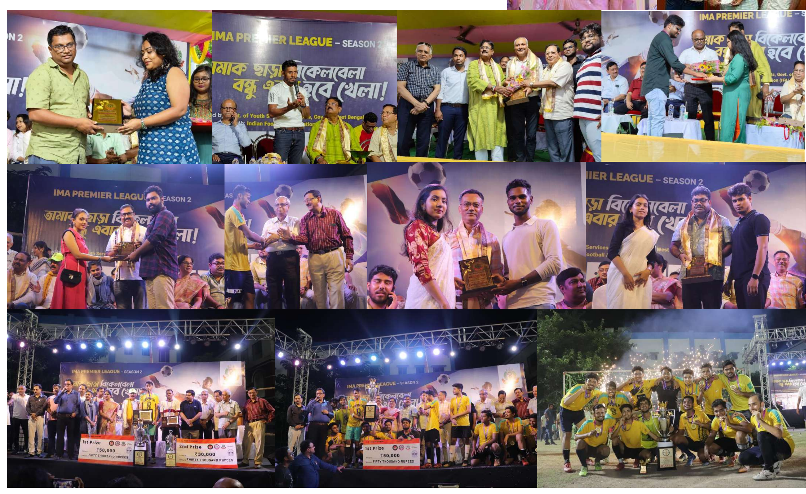
Total 22 Medical Colleges have participated.

Congratulations to IPGMER and SSKM Hospital (Champion) and NTS Tamralipto Govt Medical College and Hospital (Runner Up). Final match cum prize distribution ceremony has been graced by following luminaries from field of Sports and Medicine. Dr. Shashi Panja (Hon'ble Minister, Govt of WB), Sri Prasun Banerjee (MP and renowned Footballer), Sri Babun Banerjee